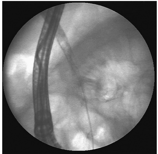
Figure 1. ERCP demonstrated dilatation in intrahepatic bile ducts and common bile duct.

A 58-year-old female patient admitted to the emergency department with fatigue, malaise, loss of appetite, and abdominal pain. Her medical history revealed hypertension and hyperlipidemia for two years. On physical examination, she had pain on the right upper quadrant and her scleras were icteric. Laboratory investigation results were as follows: glucose: 127 mg/dl, aspartate aminotransferase: 541 U/L, alanine aminotransferase: 886 U/L,