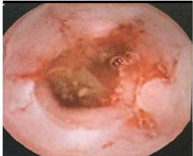
Figure 1. Video capsule enteroscopy showed a single ulcer in the proximal jejunum

The upper GI and small bowel follow-through contrast study showed no definite evidence of abnormal bowel dilatation or obstruction. Subsequently, being able to define possible mucosal lesions in the small bowel, video capsule enteroscopy was performed (Figure 1), which demonstrated a single ulcer in the proximal jejunum and few circumferential ulcerations causing strictures and bleeding in the mid-to-distal small bowel. Unfortunately, the capsule retained in the small bowel. Retrograde double balloon enteroscopy was performed to remove the capsule. Enteroscopy showed the following: (i) diffuse swelling and inflammation just above the ileocecal valve (ICV); (ii) two 0.5-1.5 cm, 1/4-1/2 circumferential ulcers were seen at 30-40 cm above ICV; and (iii) a tight stricture site 50 cm from the ICV. Contrast study through the enteroscopy showed pre-stenotic dilatation, few stricture sites, and a capsule 10 cm proximal to the tight stricture. Again, histopathology of the terminal ileum showed reactive lymphoid follicle without picture of IBD, drug-related ileitis, or specific infection. The patient remained asymptomatic.