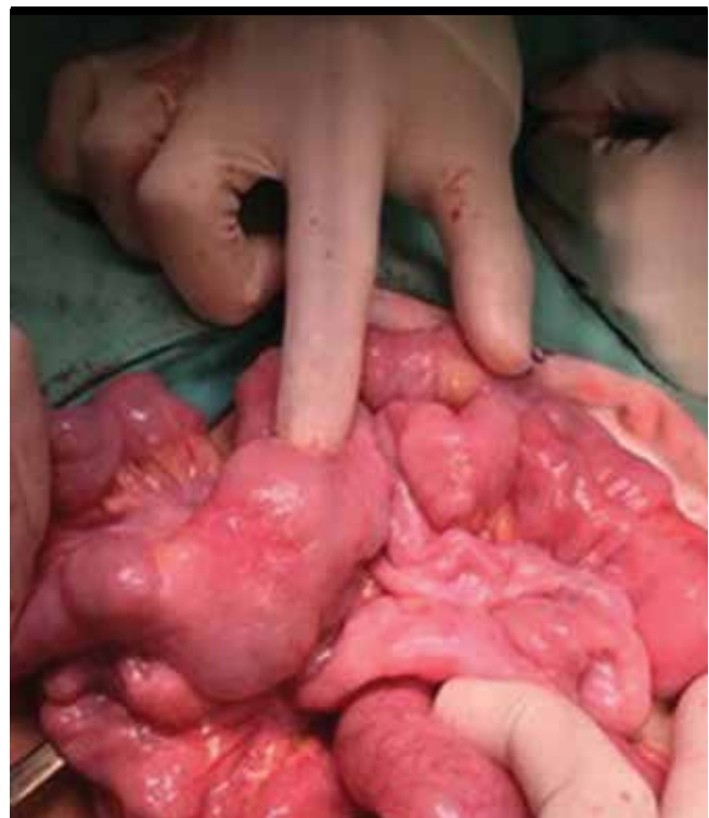
Figure 2. Dilated intestinal wall and scar were found in the small bowel. Multiple out-pouching lesions, swelling, and inflammatory spots were found along the ileum 45 cm up from the capsule-stricture point

The pediatric surgery team was then consulted for capsule removal. The initial plan was to try reducing inflammation and swelling with systemic corticosteroids (prednisolone 2 mg/kg/day), which may lead to capsule expulsion. However, after 3 weeks of prednisolone, plain