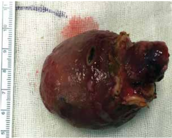
Figure 3. Laparoscopic wedge resection was performed for the complete removal of the giant polyp (7.5×6.5×5.5 cm at the macroscopic examination)